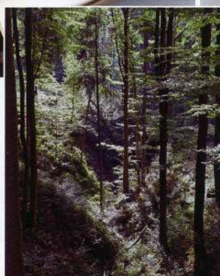
INSPIRATION The forest on the fringes of the Northern Vosges National Park in north-eastern France MATERIAL Crystal and ash wood