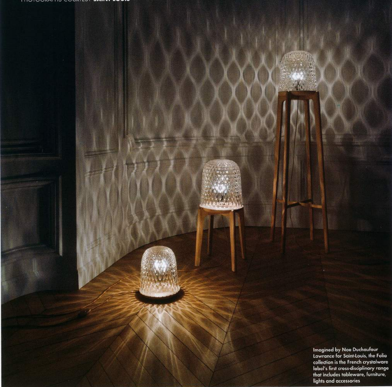
Imagined by Noe Duchaufour Lawrence for Saint-Louis, the Folia collection is the French crystalware label's first cross-disciplinary range that includes tableware, furniture, lights and accessories

PRODUCED BY NISHITA FIJI PHOTOGRAPHS COURTESY SAINT-LOUIS