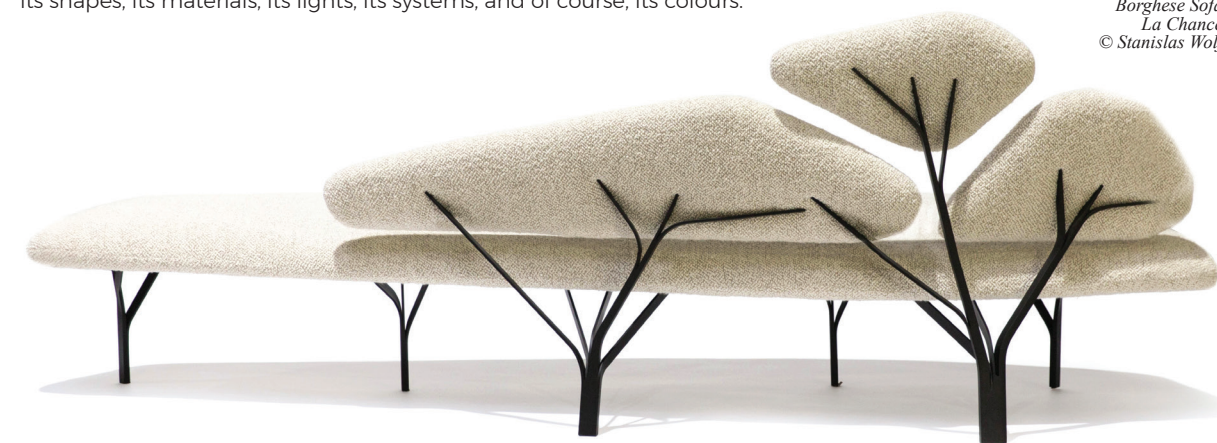
Borghese Sofa La Chance © Stanislas Wolf

I love desaturated colours, like the ones you can only obtain with natural ingredients. For the upholstery of the Borghese sofa, which I designed in 2012 for La Chance, I selected a natural green colour combination which is inspired by the foliage of the Stone Pines of the Villa Borghese in Rome. My work has always been inspired by nature. I want to recreate what we feel when we observe and contemplate the natural world through design – I want to recreate the fragile link between our external environment and our interior architecture. This is why my inspiration is based on emotion, contemplation, admiration and immersion in nature: its shapes, its materials, its lights, its systems, and of course, its colours.