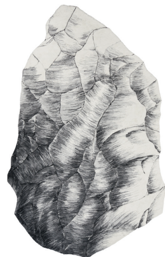
Raw Collection Tai Ping

● Noé DUCHAUFOUR-LAWRANCE NDL Design Studio