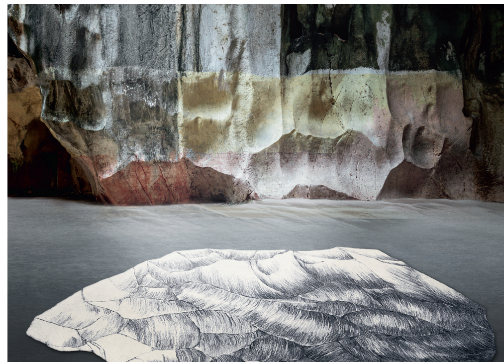
Raw Collection Tai Ping

I have a soft spot for the colour blue, nautical style and denim. For Aqua, my first surfboard design, I used a blue watercolour technique which references the control of water – fundamental in both water colouring and surfing. Being born in Brittany, I need to live near the sea. The ocean fuels my mind and creative process. This is why I now share my time between France and Portugal; both countries offer easy and quick access to the blue of the ocean.