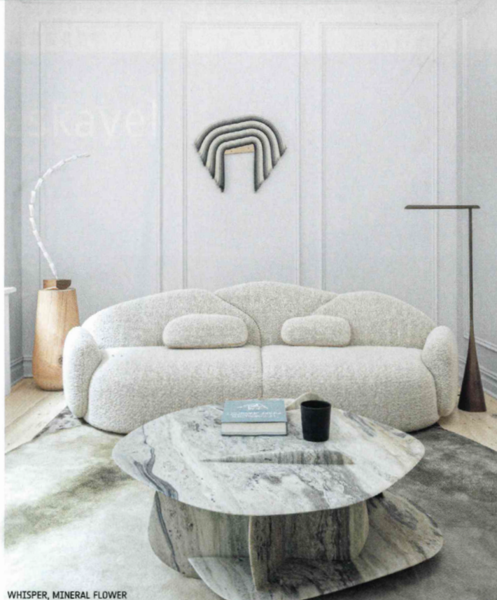
WHISPER, MINERAL FLOWER