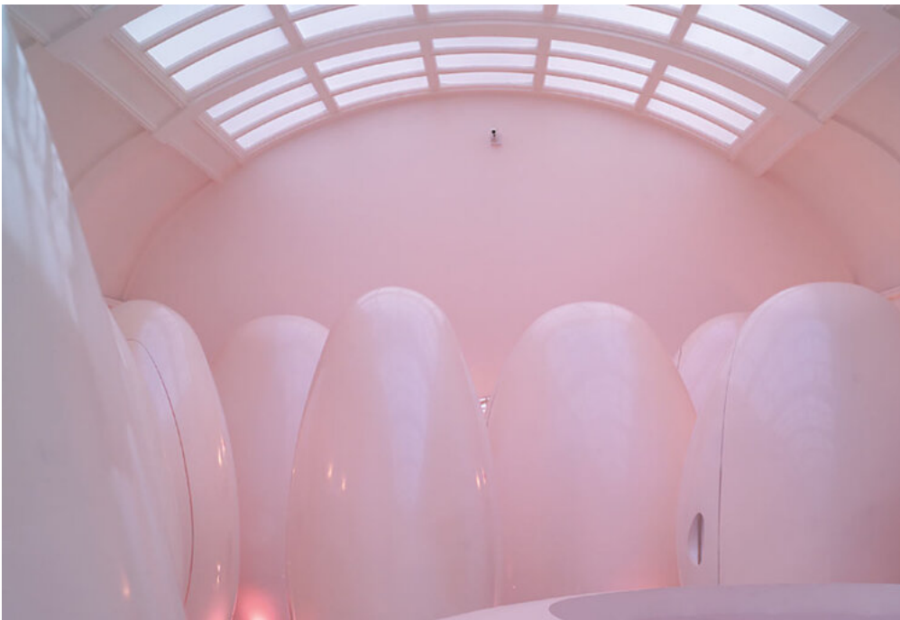
Sketch London \\\ ©Ken Hayden