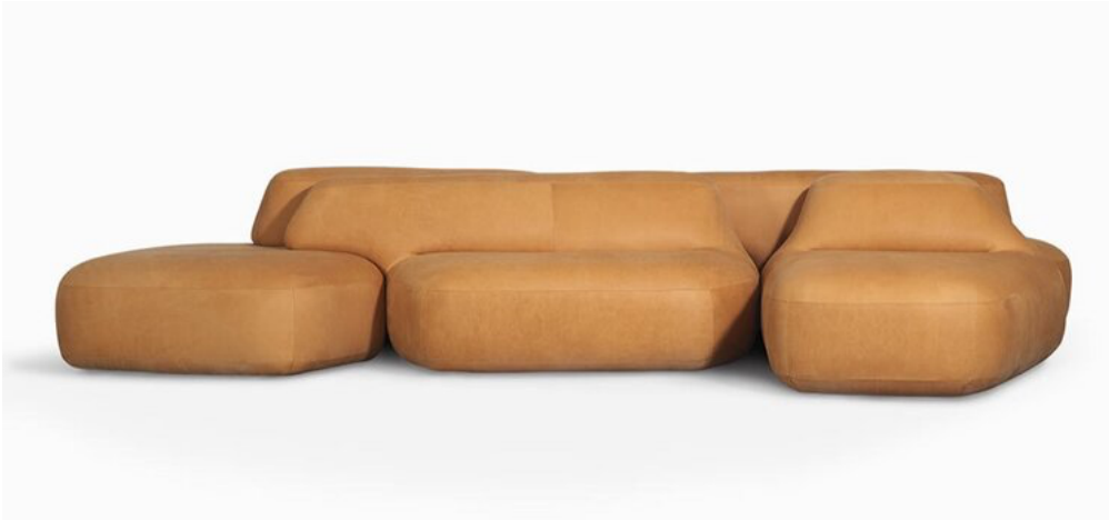
JON sofa - NDL Editions

The iconic Jotter Parker Criterium pen in 0,5, that I use with a Montblanc in 0,7mm. I draw on a Moleskine notebook and always use the same tools.